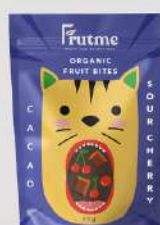
Frutme Organic Fruit Bites Cacao & Sour Cherry