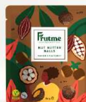
Frutme Nut Butter Balls Hazelnut