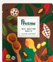
Frutme Nut Butter Balls Peanut