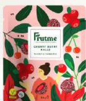
Frutme Cherry Berry Balls