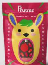
Frutme Organic Fruit Bites Pomegranate