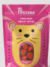
Frutme Organic Fruit Bites Strawberry