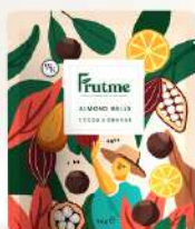
Frutme Almond Balls Cacao & Orange