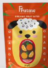
Frutme Organic Fruit Bites Orange