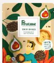
Frutme Chia Balls Fig & Walnut & Chia Seeds